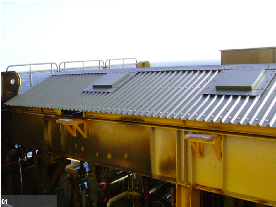
01 - Bilfinger Salamis UK designed and installed a new roof on the Fulmar A platform