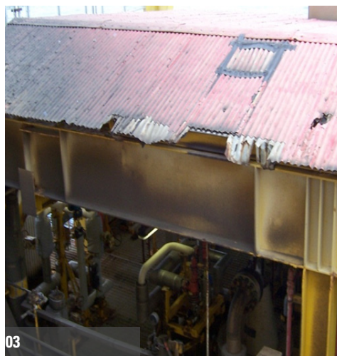
03 - The deterioration of the existing roof was allowing water ingress